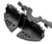
Aluminium Rail Holder