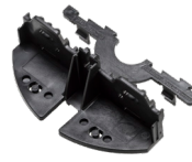
Aluminium Rail Holder