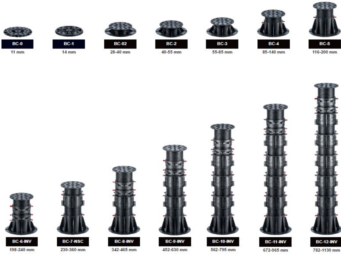
FIGURE 2 – BUZON PEDESTALS – BC SERIES